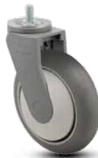
5-56HN-314GD STEM 1 (shown in photo)