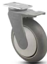
5-50HN-314GD TL PLT 2 (shown in photo)