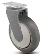
5-50HN-314GD PLT 2 (shown in photo)