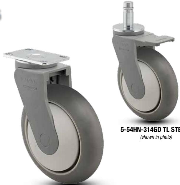
5-50HN-314GD TG A PLT2 (shown in photo)