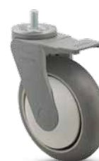
5-56HN-314GD TL STEM 1 (shown in photo)