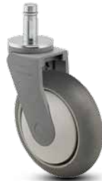
5-54HN-314GD STEM 1 (shown in photo)