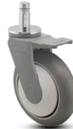
5-54HN-314GD TL STEM 1 (shown in photo)